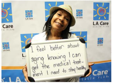
"I feel better about aging knowing I can get the medical treatment I need to stay healthy."

"Having medical insurance makes me feel safe."