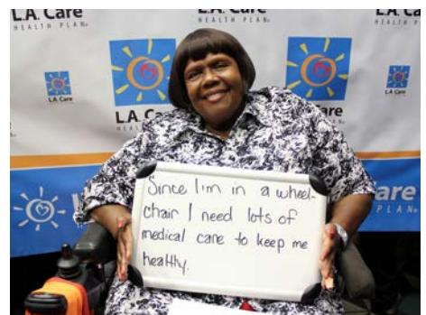
"Since I'm in a wheelchair I need lots of medical care to keep me healthy."